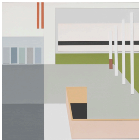
Figure 4: Hushed Tonalities. Hand painted collaged visualization based on studies of buildings by Reiach & Hall Architects, Edinburgh, 2014. Light, shadow, soft tones and the influence of landscape are the key elements of this strategy.