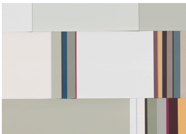
Figure 3: Hand painted colour portrait based on building study of Hans Scharoun's Reading room, Staatsbibliothek, Berlin. Collage, acrylic paint on card.

A collage technique is commonly used to juxtapose remotely sourced images, textures and media to convey meaning, for example in Richard Hamilton's 'Just what is it that makes today's homes so different, so appealing' (1956). The technique itself offers a mode of inquiry and a 'conceptualising approach' (Butler-Kisber in Knowles and Cole (2008): 270), to help develop a response to a research question through drafts and re-drafts in a similar honing to the production of text. In the case of the Colour Strategies project, an abstract portrait of each building was assembled using the painted swatches, and is therefore similarly rich in data. Each coded colour contains information about the original building from which it was sourced. The collage affords an immediate representation of this assembly, with each element layered to denote hierarchy, proportional extent and location. The collage method also enabled the interdisciplinary research team to explore the overall characteristics of the palette and various relationships within it, and so incorporated a layering of tacit knowledge (regarding colour use, geographical and cultural differences, for example) in the research findings.