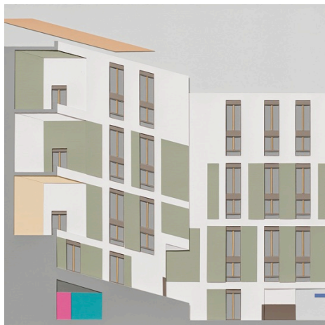
Figure 5: 'Second Layer' visualisation, based on studies of the buildings of Knapkiewicz and Fickert. Hand-painted collage, acrylic paint on card.

If this logic is followed, then paintings may have the capacity to convey meaning in a form with which audiences are more readily willing to engage, because they tap into certain conventions expected of art. Any composition will be selective in what is chosen to foreground to the audience, and what is omitted. In the visualisation illustrated, based on buildings in central Scotland by Reiach and Hall Architects, the aim was to communicate a colour strategy that is largely material based, deliberately subdued in tone, and enlivened by the play of light, shadow and the colour of the landscape. Although at first the painting may appear literally descriptive, it is abstracted and is not representative of a specific space. To elicit a feeling of spaciousness, a high perspectival viewpoint was taken to give the impression of suspension in space. The white upper wall wraps across the top of the painting to further suggest a large open space, and a feeling of low northern light and shadow was introduced within the composition by tonal shifts on the floor. The placing of each colour in this instance was intended to convey a restful, calm space, with a passive viewer. Conventions of painting composition, vector lines, figure and ground can therefore be applied to such a visualisation to aid in the intended communication.